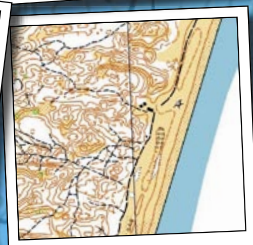
MAP OVER YNGSJÖ.