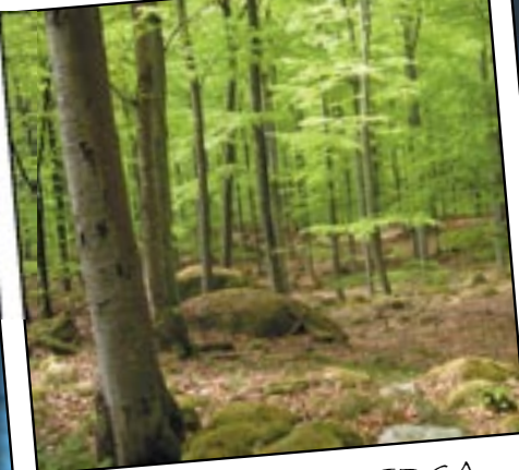
FOREST AT DEGEBERGA. SOUTH OF KRISTIANSTAD.