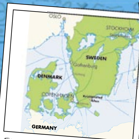
EUROPE'S ORIENTEERING CENTER

A taste of Sweden's most international terrain. Frequent training camp for several national teams.