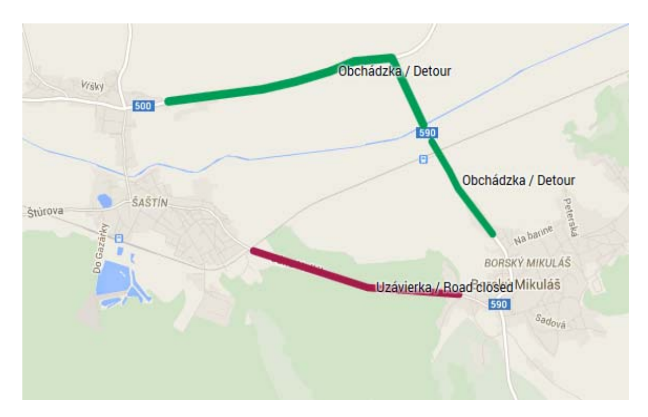
Map No. 4: Possible route to Event Centre from Kúty (highway D1)