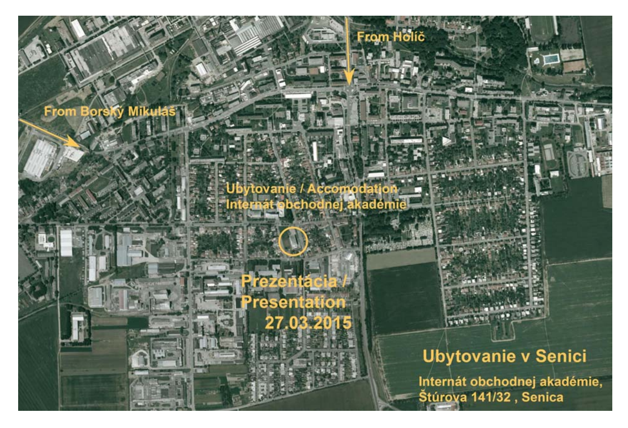
Map No. 3: Accommodation in Students hostel in Senica