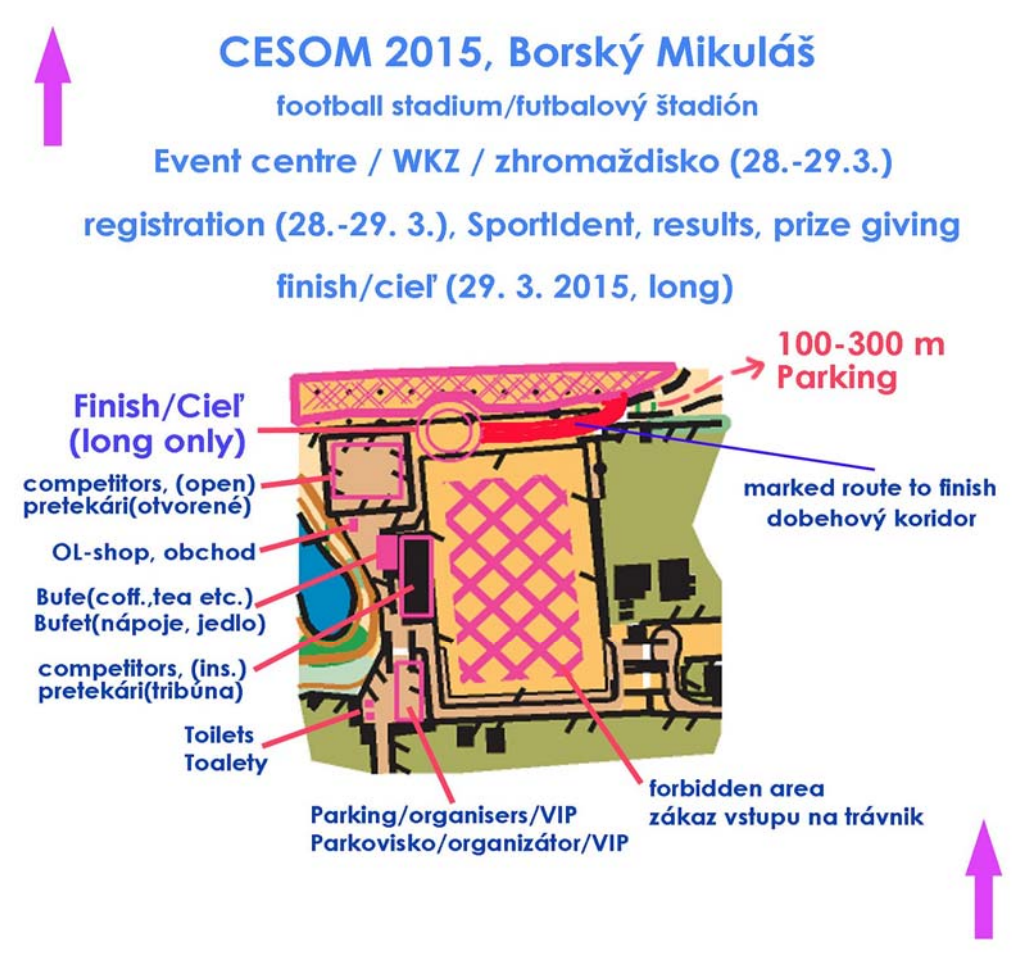
Map No. 1: Competition Centre – Football stadium